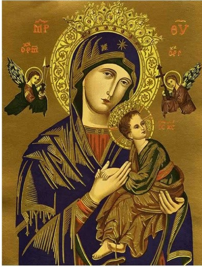
Our Lady of Perpetual Help

Our Mother of Perpetual Help 5 July 2020 A.D.