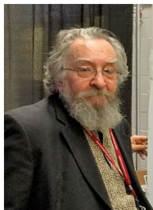
Born: Rybnecke, Ukraine 1942

The perfect gifts for St. Nicholas, Christmas and New Year - not to mention: Birthdays and just-because!