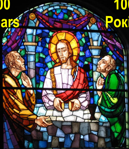
Leo Mol's Holy Eucharist window (Luke 24:30-31)