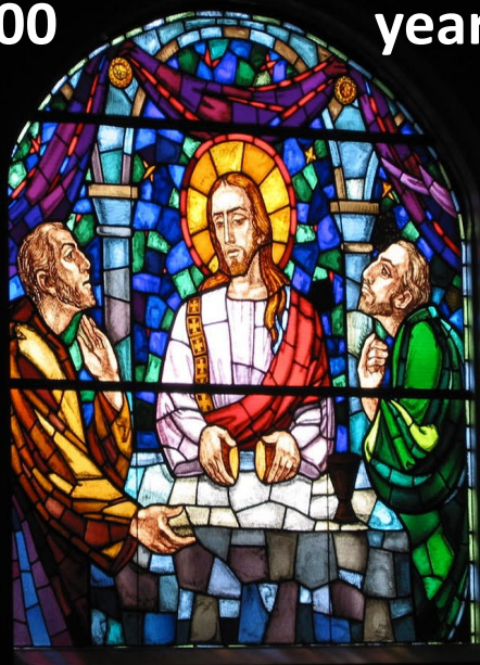
Leo Mol's Holy Eucharist window (Luke 24:30-31)