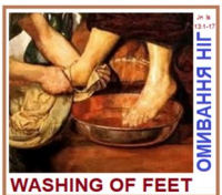
WASHING OF FEET

Come join the Clergy, Religious and all the Faithful of the Arch-eparchy as they come together for the ancient tradition of the Holy Thursday commemoration of Christ's institution of the Holy Eucharist and the Holy Priesthood at the "Last Supper".