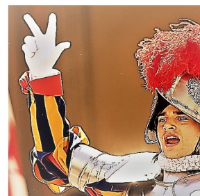
Invoking the Trinity when taking an oath of loyalty