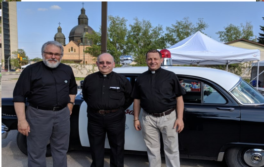
What do you get when you cross 3 Priests and a Police Car...?????