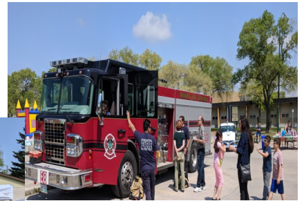
City of Winnipeg Fire and Paramedics showing the children the workings of the fire trucks!!