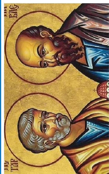
Holy Apostles Peter & Paul Апостоли Петро і Павло

4th Sunday after Pentecost/All Saints Rus-Ukraine 28 June 2020 A.D.