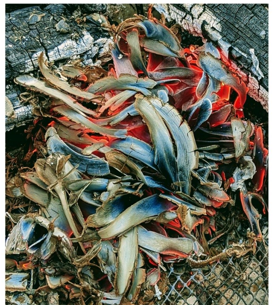
'Angel Feathers' - the wooden sticks used to distribute Holy Communion during the Pandemic are respectfully burned regularly

Господи, Господи! Поглянь з неба, подивись і посіти виноград, який насадила твоя правиця. Нехай всемогутня твоя рука буде заєдно над цим народом, що його Ти полюбив. Давай йому, предвічний Боже, у кожному поколінні, аж до кінця світу, єпископів і священиків святих, повних твого Духа — пастирів і вчителів твого закону, що вміли б незмінно зберігати правду твого святого об'явлення та з любови навчати і судити цей великий нарід. Даруй українському духовенству ласки ніколи не боятися ніякого пожертвування, де тільки йде про твою славу і добро цього народу. Розпали в серцях українських священиків духа ревности про спасення душ. Відкрий перед їхніми очима премудрість твого об'явлення і дай їм високе почуття святости того діла, до якого Ти їх покликав. Благослови їх працю і їх наміри. Хорони їх від усякого лиха, а передусім від смертного гріха. І злучи їх Твоєю благодаттю, щоб любов'ю були одно — так як Ти, Отче, зі Сином своїм, і Син з тобою. Амінь.