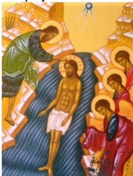
Lord's Baptism in the Jordan