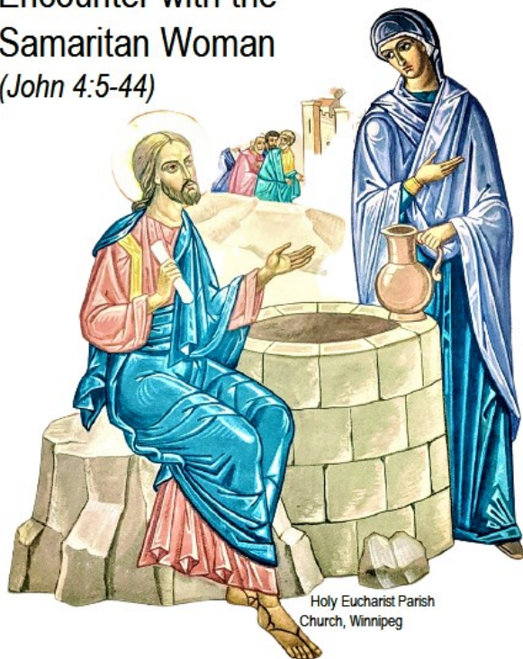
Holy Eucharist Parish Church, Winnipeg

Encounter with the Samaritan Woman (John 4:5-44)