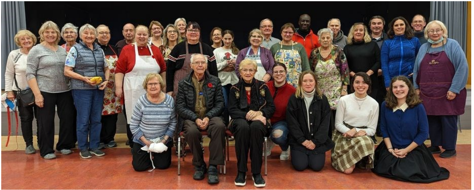
Our Drive-Thru Fall Supper was held last Sunday and was a success. Thank you to the many, many volunteers who gave of their time, talent, and treasure to make this happen. The above photo of some of the volunteers was taken just after the end of the Supper.