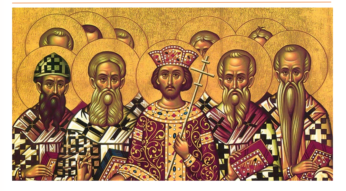
Commemoration of the First Six Ecumenical Councils. Octoechos Tone 6.